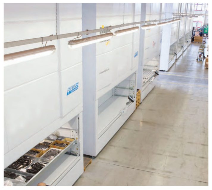
Floor Space Recovery