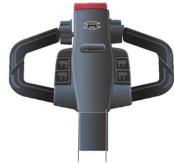
ERGONOMIC OPERATOR'S HANDLE